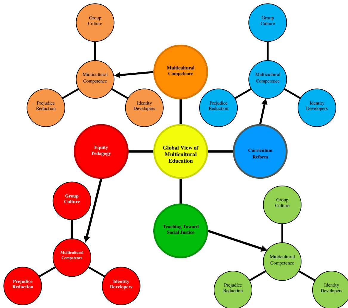
Figure 3: Conceptual Framework of the Global Perspective of Multicultural Education

Multicultural competence is the process in which a person develops competencies in multiple ways of perceiving, evaluating, believing, and solving problems. The purpose is to focus on understanding and learning to negotiate cultural diversity among nations as well as within a single nation by becoming aware of one's own perspectives as well as becoming conscious of other cultural perspectives as a foundation of informed cross-cultural interaction.